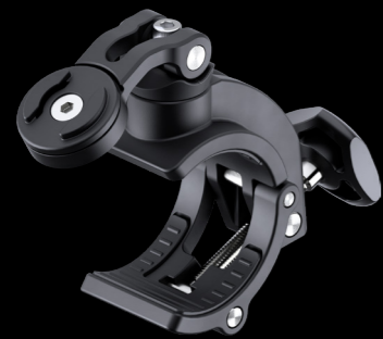
ROLL CAGE MOUNT