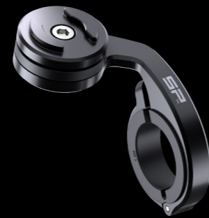
HANDLEBAR MOUNT PRO MTB