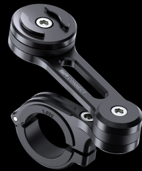
MOTO MOUNT PRO